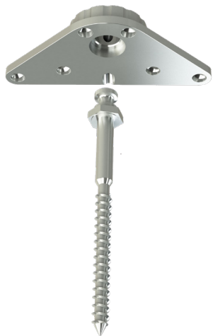
table leg connector